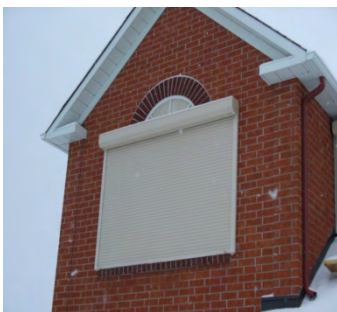
Figure 2 Rollshutter at a closed position