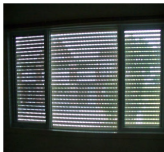
Figure 3 View to outdoor through the rollshutter