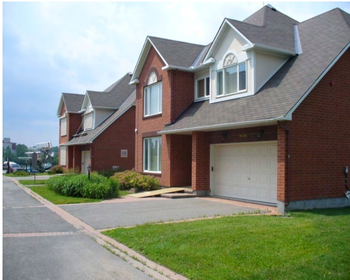
Figure 1 South façades of the CCHT Houses

Exterior insulating rollshutters are one of the most effective shading devices to reduce residential heating and cooling energy use, summer electricity peak demand, and risk of moisture condensation on internal surfaces of windows, and to improve thermal conditions near windows. Where exterior rollshutters cannot be used such as in high-rise buildings, or where there is a risk of ice build-up in winter, interior reflective shades may provide an alternative means to reduce cooling energy use and peak electricity demand compared to absorptive interior shadings.