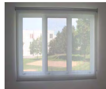
Figure 4 view to outdoor through the reflective screen