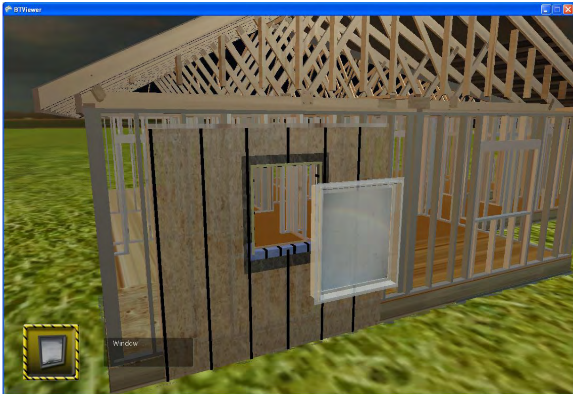
Figure 4: Screenshot from the Xbox360™ version of the guide

Some more significant differences were implemented based on feedback from education specialists. First, more configuration options were given, including settings for playing at a difficult or easy level, which toggles step to related clues such as instructions, step number, score and time feedback on and off. Second, the option to play the game in reverse was enabled to allow an alternative approach to learning the sequence material, much like how people problem solve. Third, ambient audio, appropriate to a construction zone was included and audio feedback was made more appropriate for the application, i.e. a breaking window sound for incorrect steps and active construction noises for correct choices. Finally, steps can be skipped or redone to enable people already quite familiar with construction practices to review only sections they wish to brush up on. This is consistent with the goal of making a tool useful for new workers as well as seasoned veterans wishing to review the latest recommended practices.