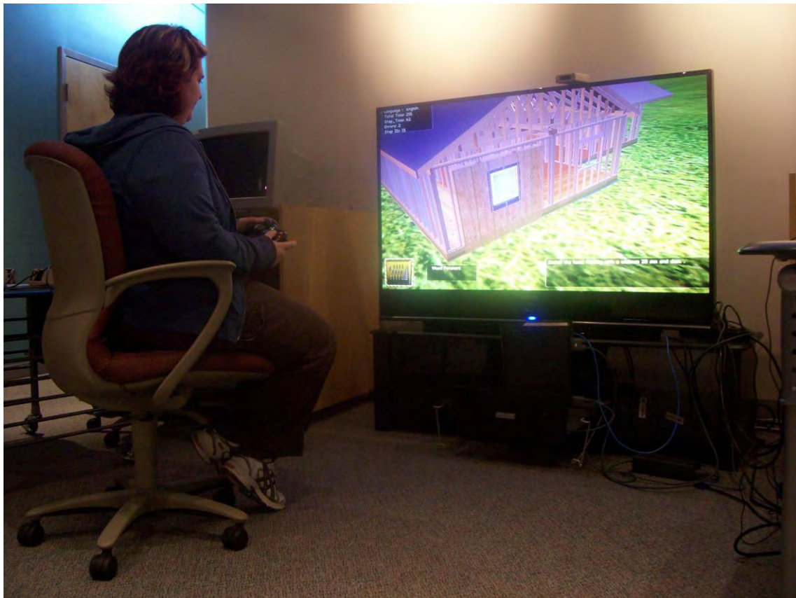
Figure 3: The Xbox360™ version of the guide

The Xbox360™ version of the guide was built to examine how easily, and naturally a best practice guide could be implemented on a gaming system, which is naturally rich in graphics and audio interaction and generally perceived to be simpler to own and operate than a computer. The Xbox360™ was picked for the development platform, as its development environment is open and free in comparison to other common gaming systems. Nevertheless, it is envisaged that what was built for one platform can likewise be implemented on other platforms. Due to the fact that games are controlled using controllers with multiple pads, joysticks and buttons compared to a PC, the interaction of the user with the guide is a little different than the PC version. Superficially, control of navigation and selection of actions was implemented with common gaming platform elements like trigger-toggled menus and joysticks for navigation. As shown in Figure 3 and 4 the interface also has a look more consistent with gaming systems.