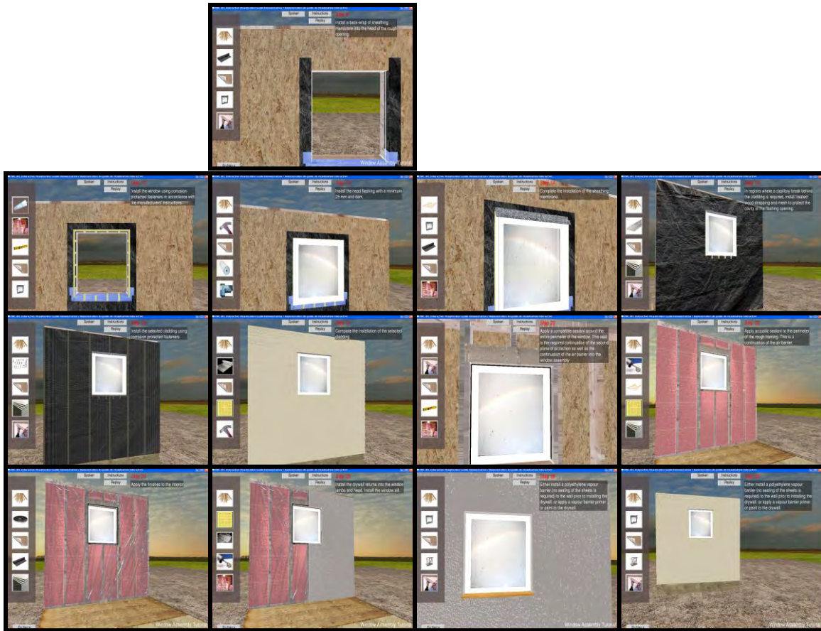
Figure 1: Components of the developed system