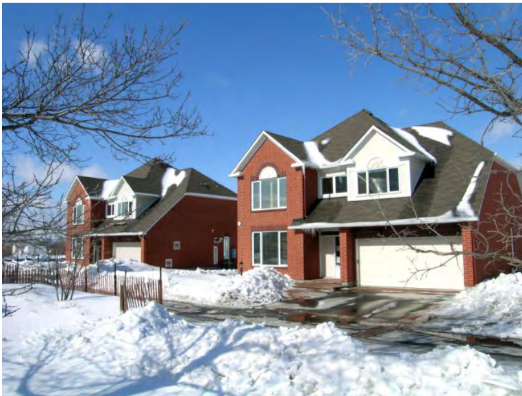
CCHT Twin Houses

The Low Solar Gain coating located on the exterior pane of the window transmits less solar radiation, and reflects heat to the exterior (an advantage during cooling season).